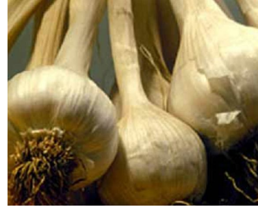
12 Indian foods that cut fat