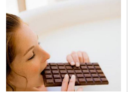
Daily dose of chocolate to lower BP