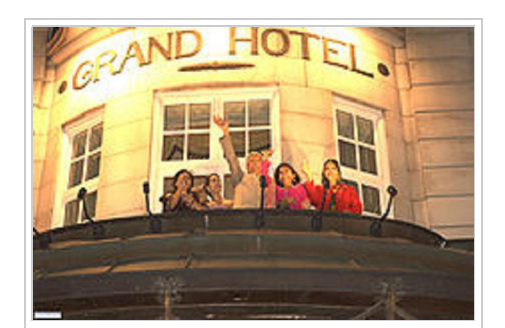
Muhammad Yunus at the Grand Hotel in Oslo, Norway

Muhammad Yunus was awarded the 2006 Nobel Peace Prize, along with Grameen Bank, for their efforts to create economic and social development. In the prize announcement The Norwegian Nobel Committee mentioned:<sup>[1]</sup>