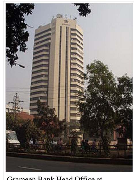
Grameen Bank Head Office at Mirpur-2, Dhaka

The Grameen Bank started to diversify in the late 1980s when it started attending to unutilized or underutilized fishing ponds, as well as irrigation pumps like deep tubewells.<sup>[19]</sup> In 1989, these diversified interests started growing into separate organizations, as the fisheries project became Grameen Motsho (Grameen Fisheries Foundation) and the irrigation project became Grameen Krishi (Grameen Agriculture Foundation).<sup>[19]</sup> Over time, the Grameen initiative has grown into a multi-faceted group of profitable and non-profit ventures, including major projects like Grameen Trust and